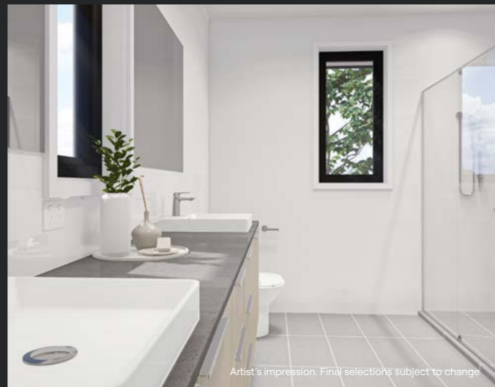
Artist's impression. Final selections subject to change