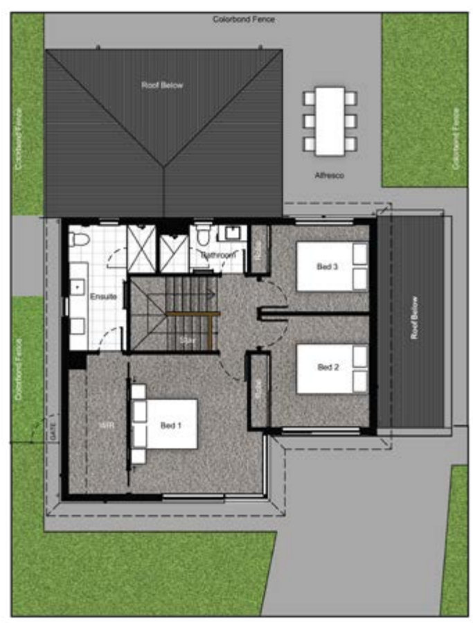
Archer - First Floor