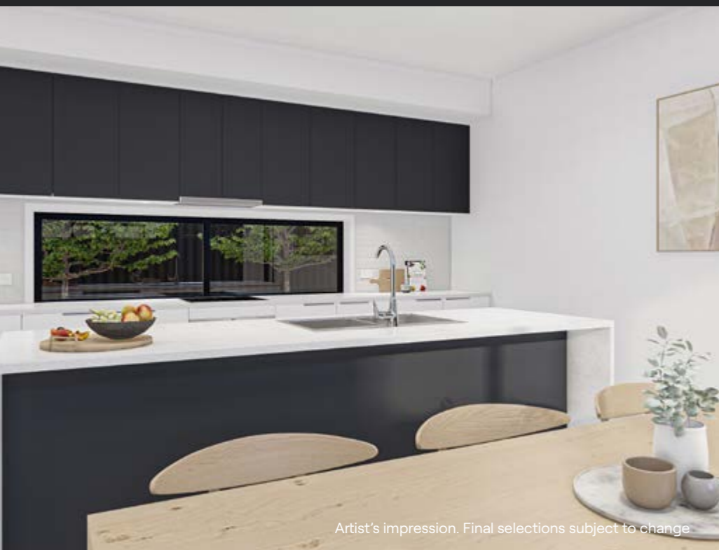
Artist's impression. Final selections subject to change