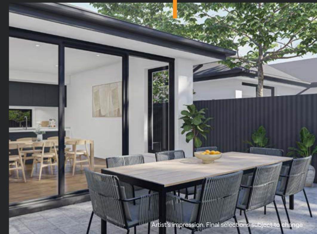
Artist's impression. Final selections subject to change