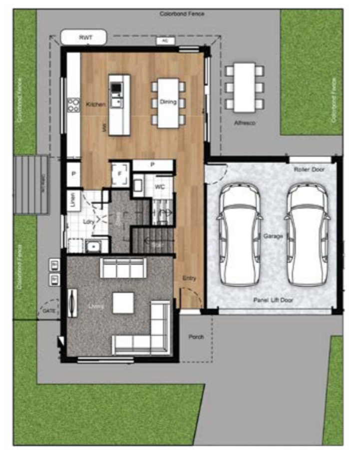
Archer - Ground Floor