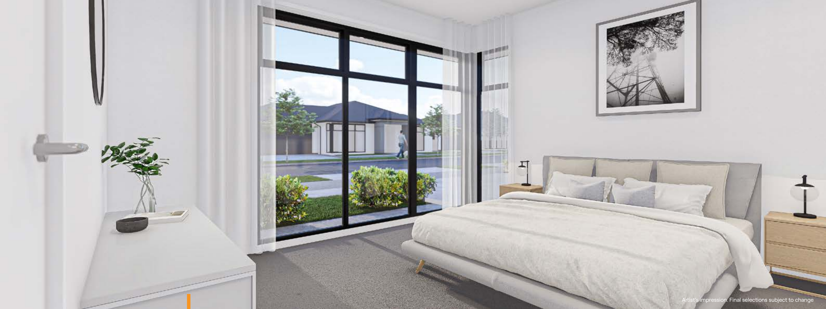
Artist's impression. Final selections subject to change