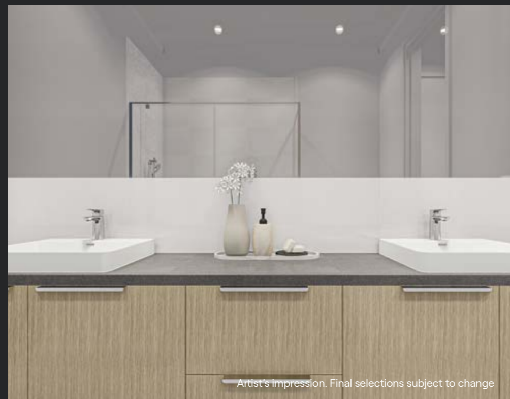
Artist's impression. Final selections subject to change