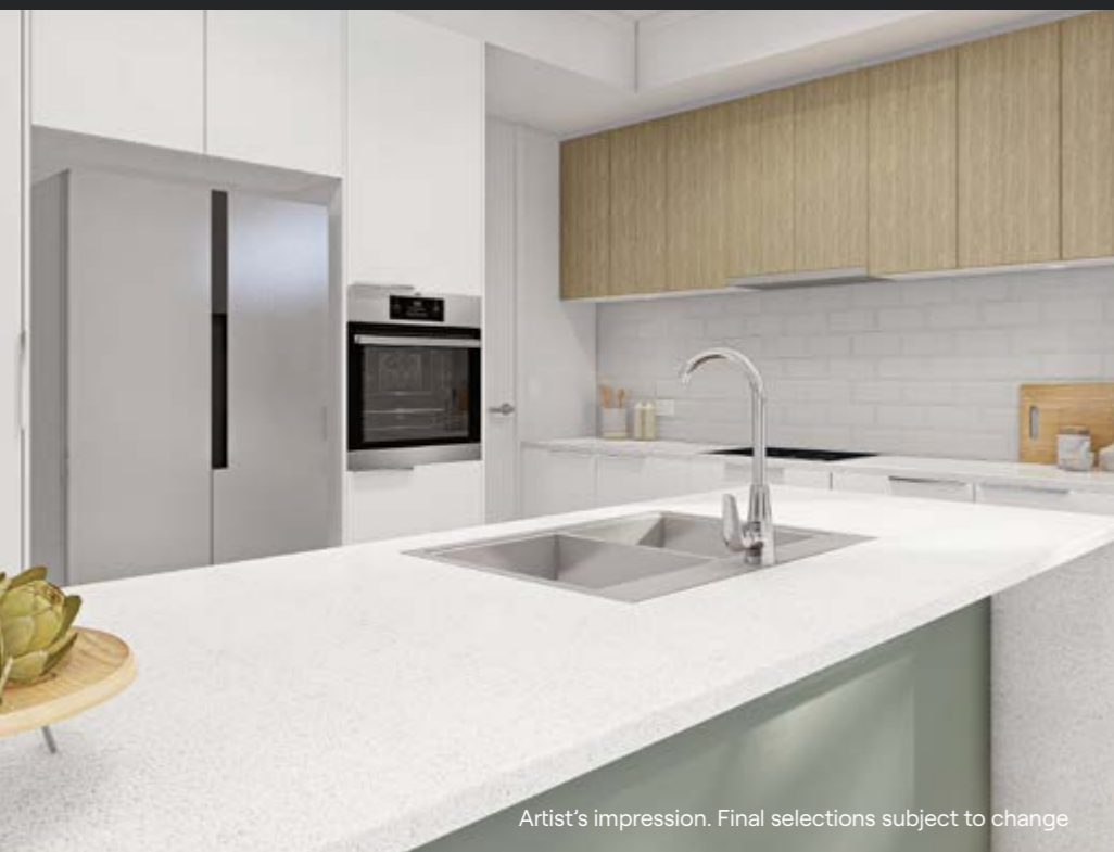
Artist's impression. Final selections subject to change