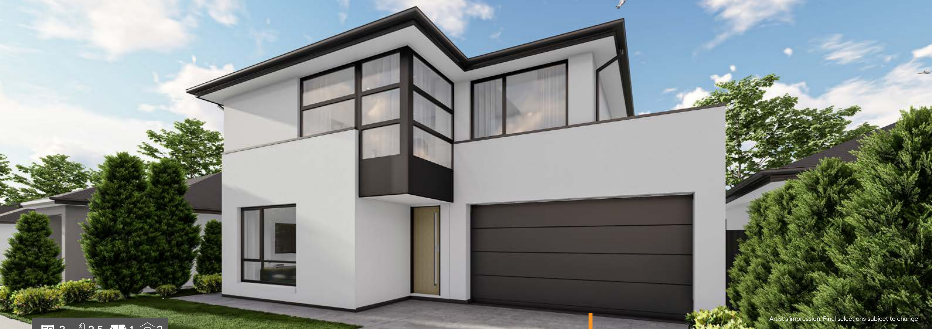
Artist's impression. Final selections subject to change