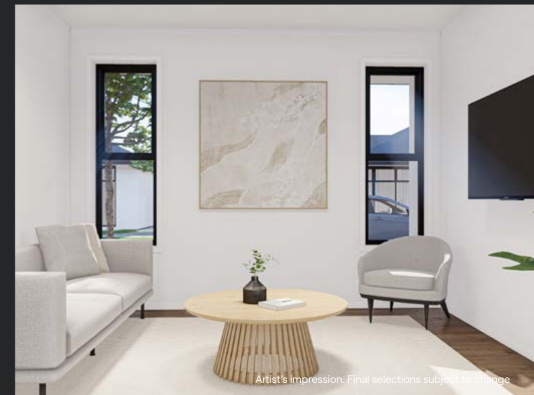
Artist's impression. Final selections subject to change