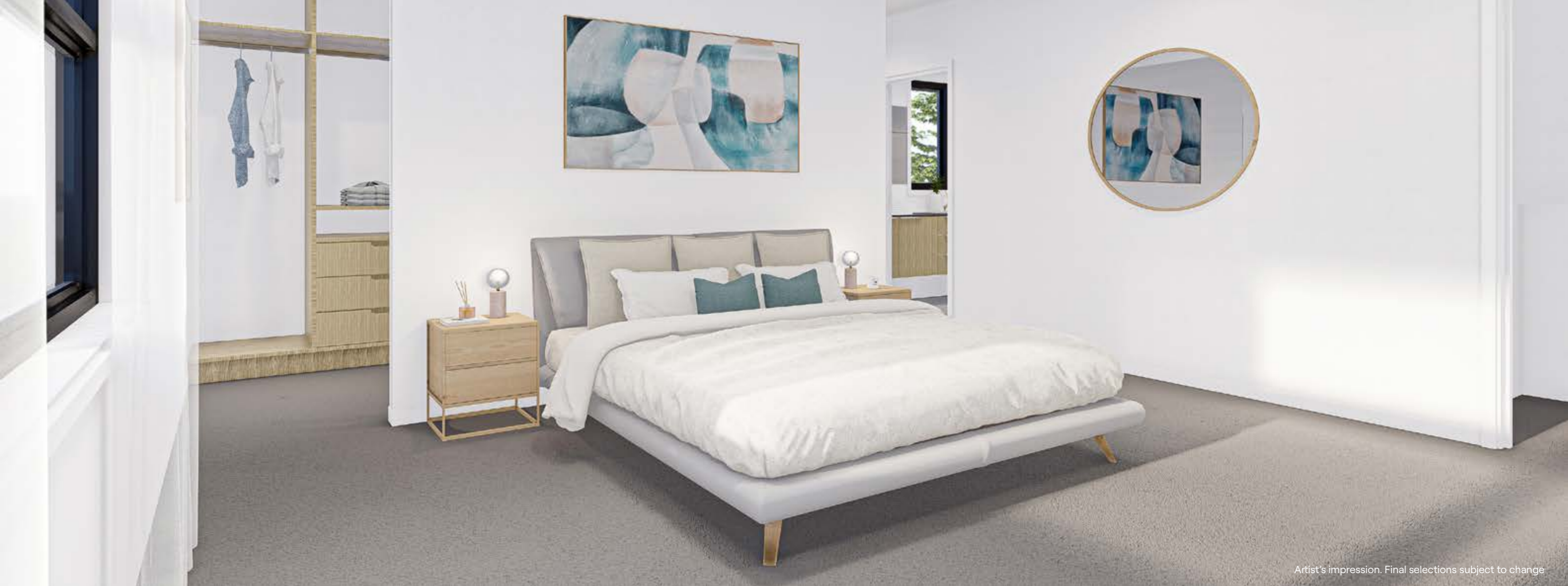
Artist's impression. Final selections subject to change