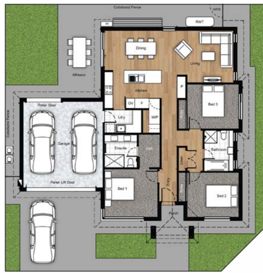
Addison - Ground Floor

With a double garage, generous storage and ample accommodation – Addison is a stylish choice for families looking for a lock-up-and-go lifestyle. Each Lanser Living home will be surrounded by a network of parks, walking trails and play spaces designed to maximise convenience and healthy living.