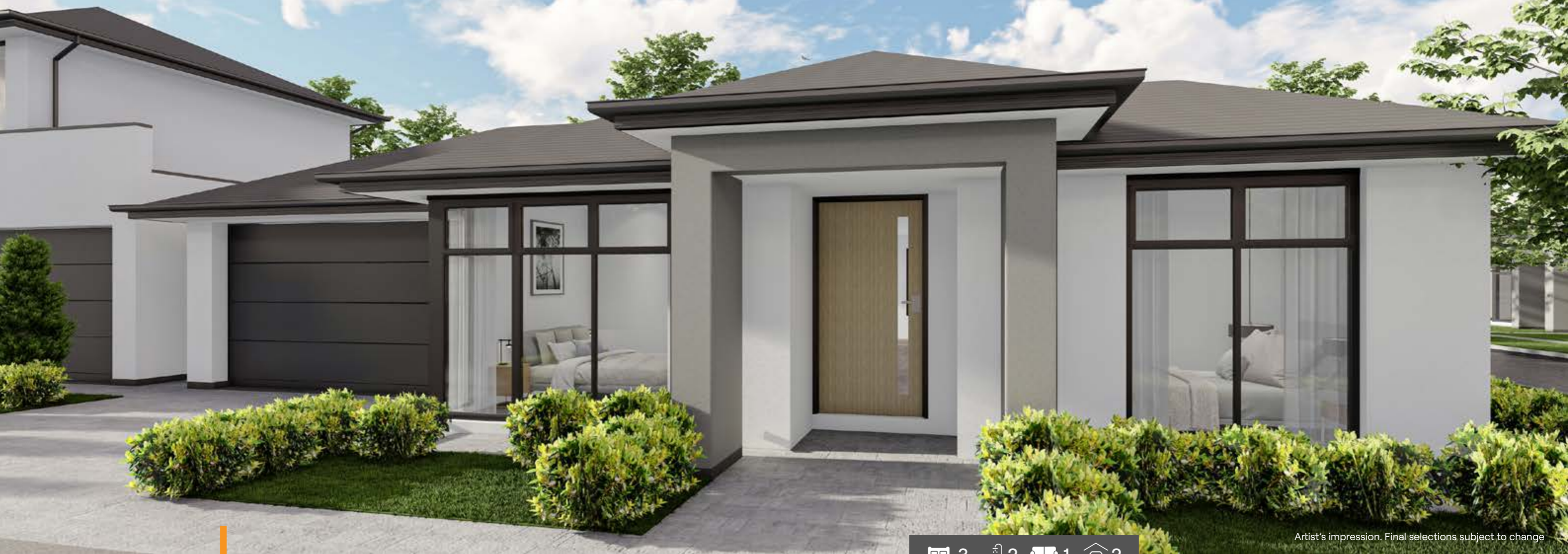
Artist's impression. Final selections subject to change