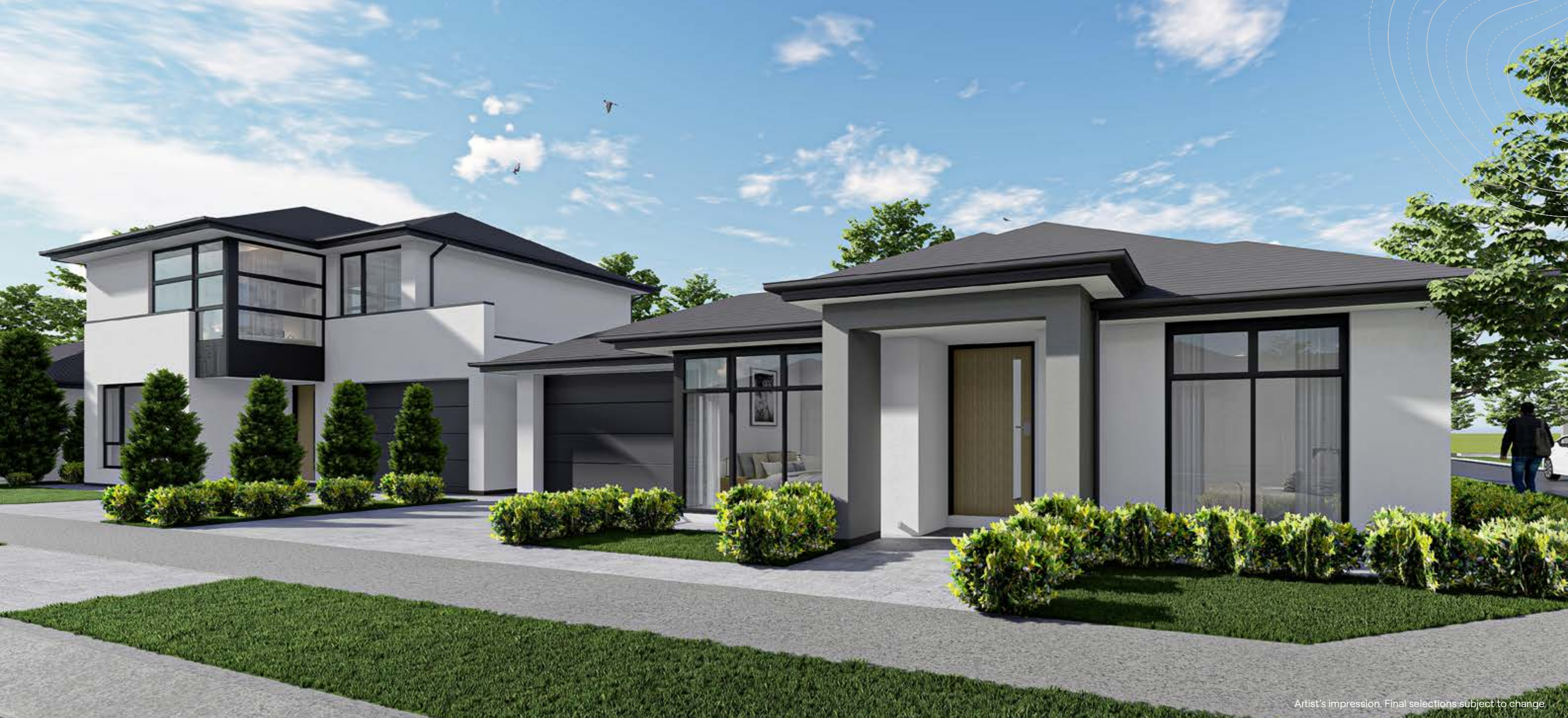
Artist's impression. Final selections subject to change.